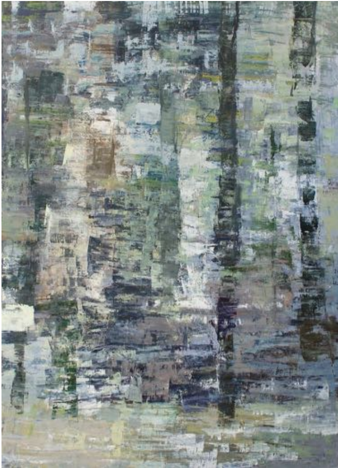
Edge of the Woods 2, 2019 Mixed Media on Canvas, 72x54