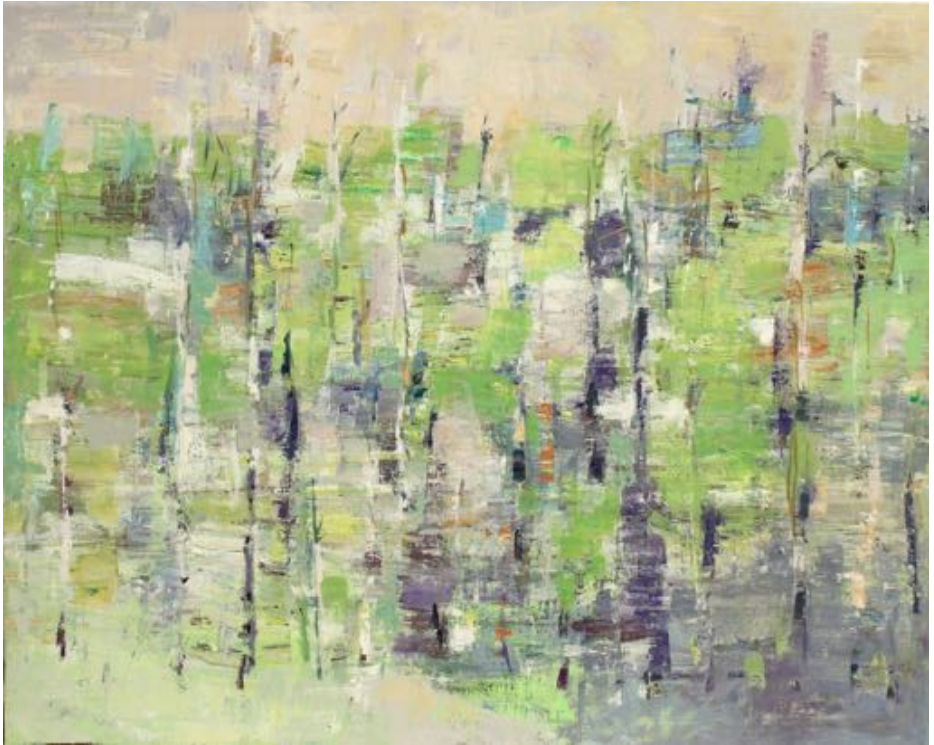
Treeline 7, 2019 Oil on Paper, 36x48