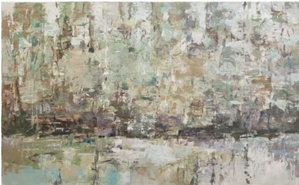
Audubon 1, 2019 Mixed Media on Canvas, 44x66