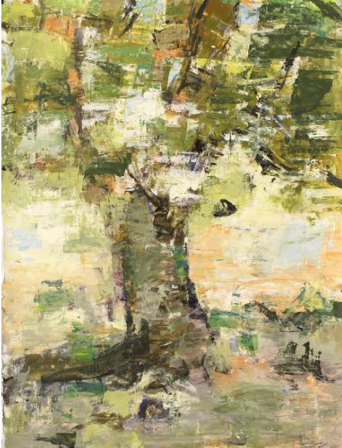
Nature Study 3, 2019 Oil on Paper, 30x22