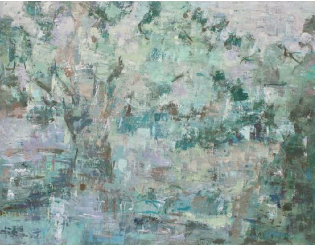
Oak at Audubon, 2019 Mixed Media on Canvas, 46x60