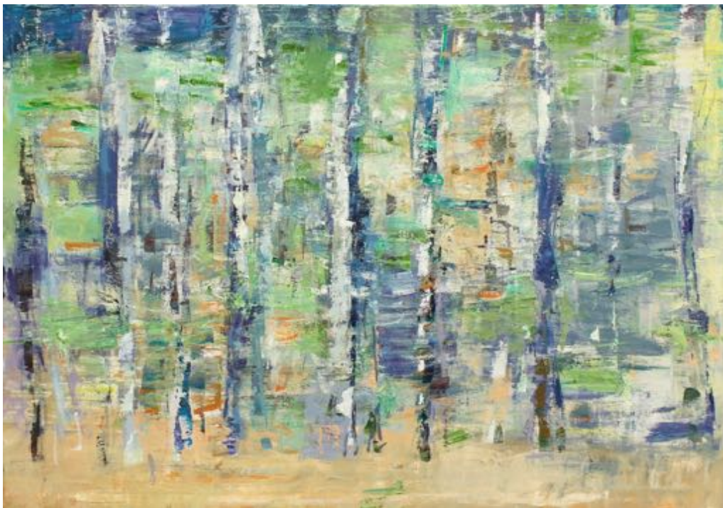
Treeline 8, 2019 Oil on Canvas, 30x40