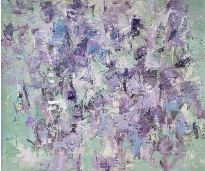
By the Road Flowers, 2019 Mixed Media on Canvas, 18x24