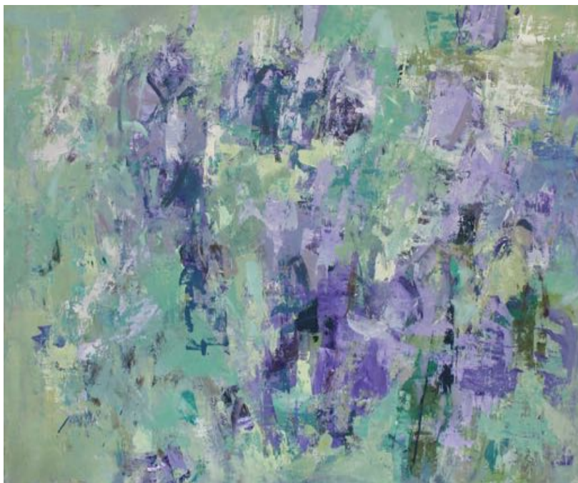
By the Road Flowers 5, 2019 Mixed Media on Canvas, 18x24