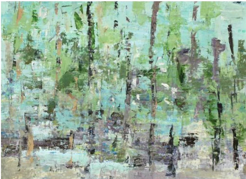
Nature Study 7, 2019 Oil on Paper, 22x30