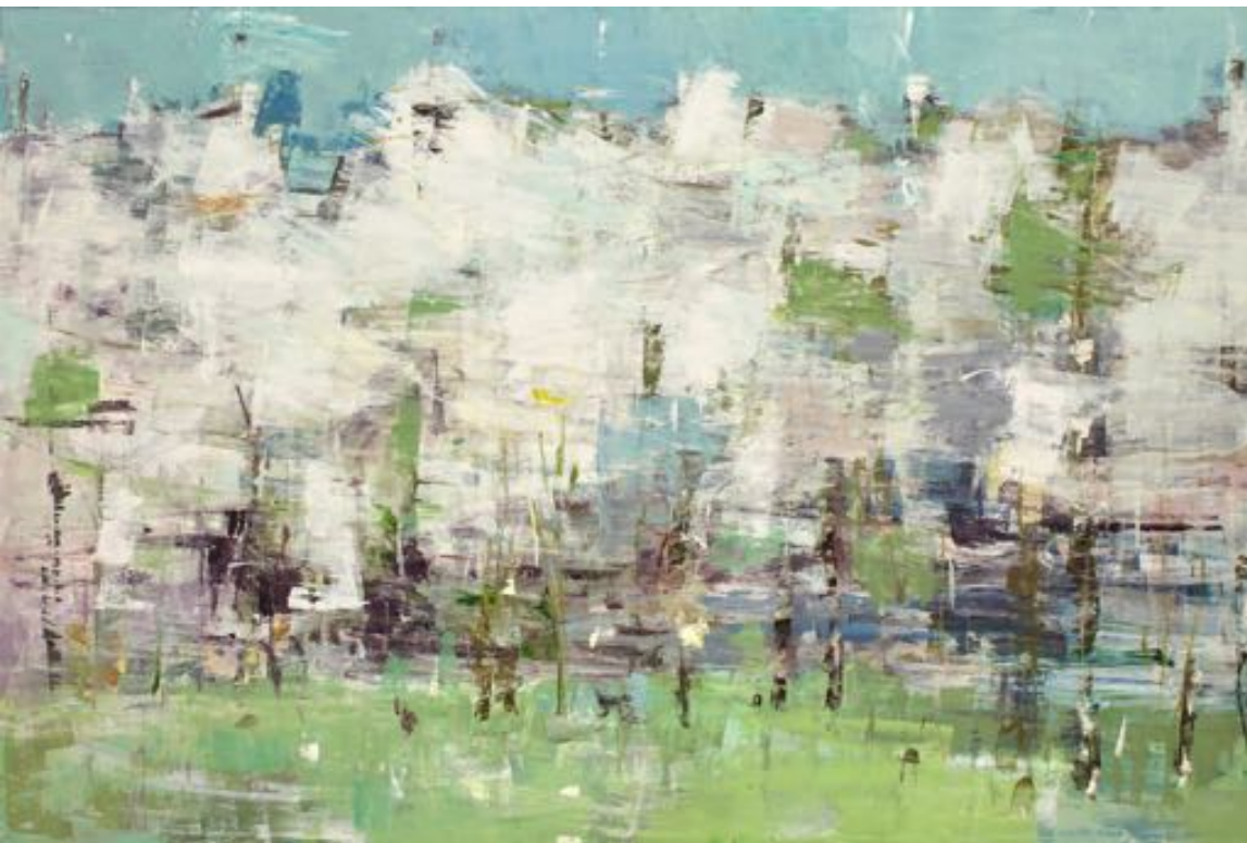
Blooming Trees 1, 2019 Oil on Canvas, 48x72