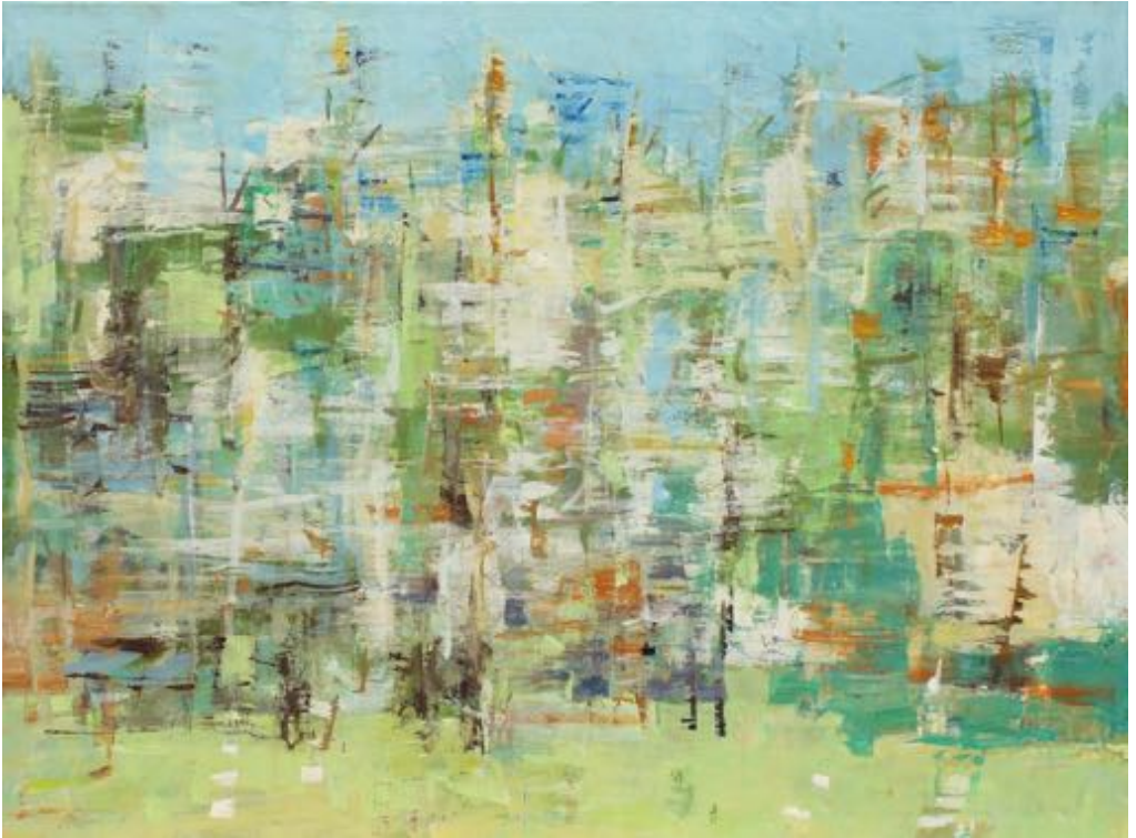
Treeline 6, 2019 Mixed Media on Canvas, 36x48