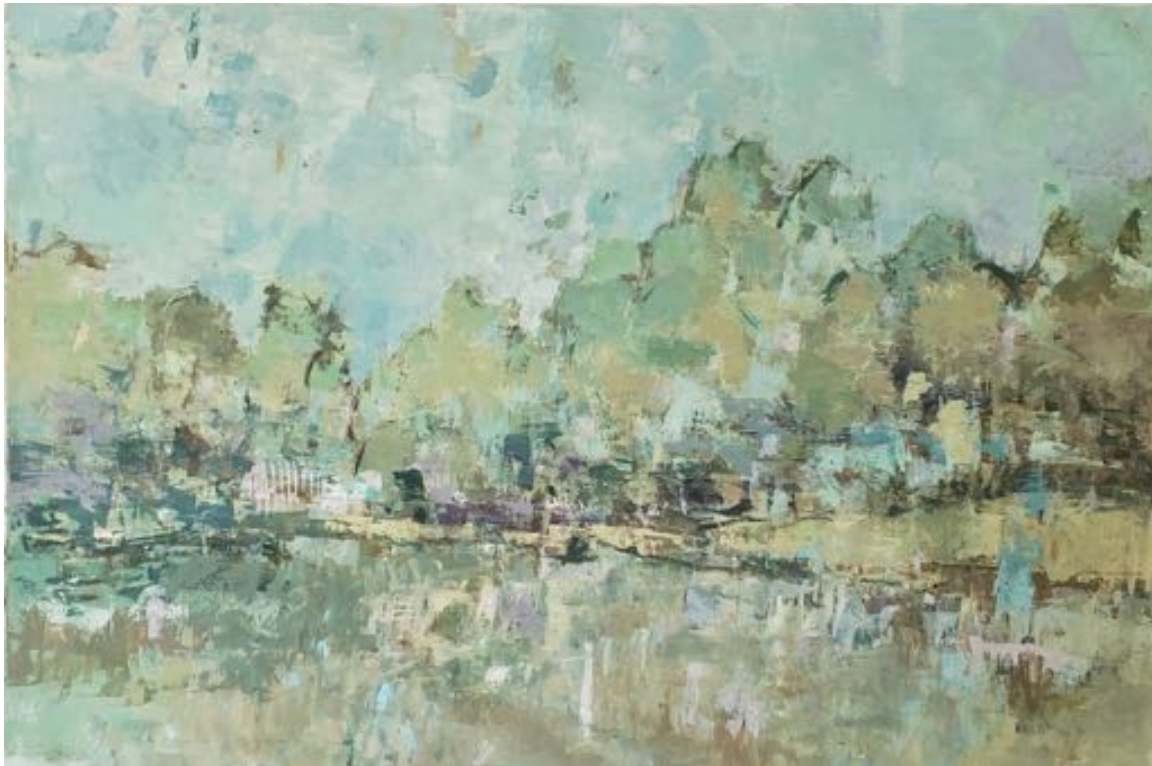
Hanging at Winifred's 2, 2019 Mixed Media on Canvas, 44x66