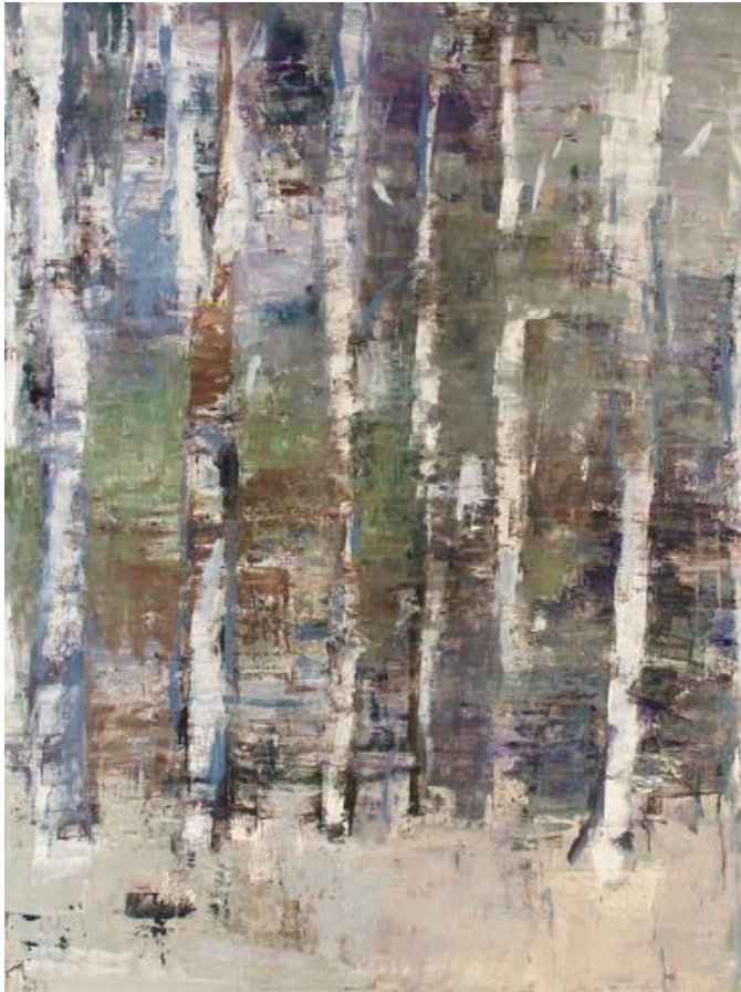
White Trees 2, 2019 Mixed Media on Canvas, 40x30