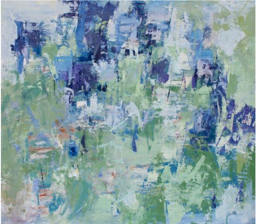
By the Road Flowers, 2019 Mixed Media on Canvas, 20x24