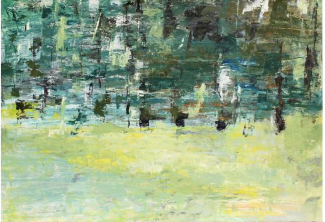
Nature Study 9, 2019 Oil on Paper, 22x30