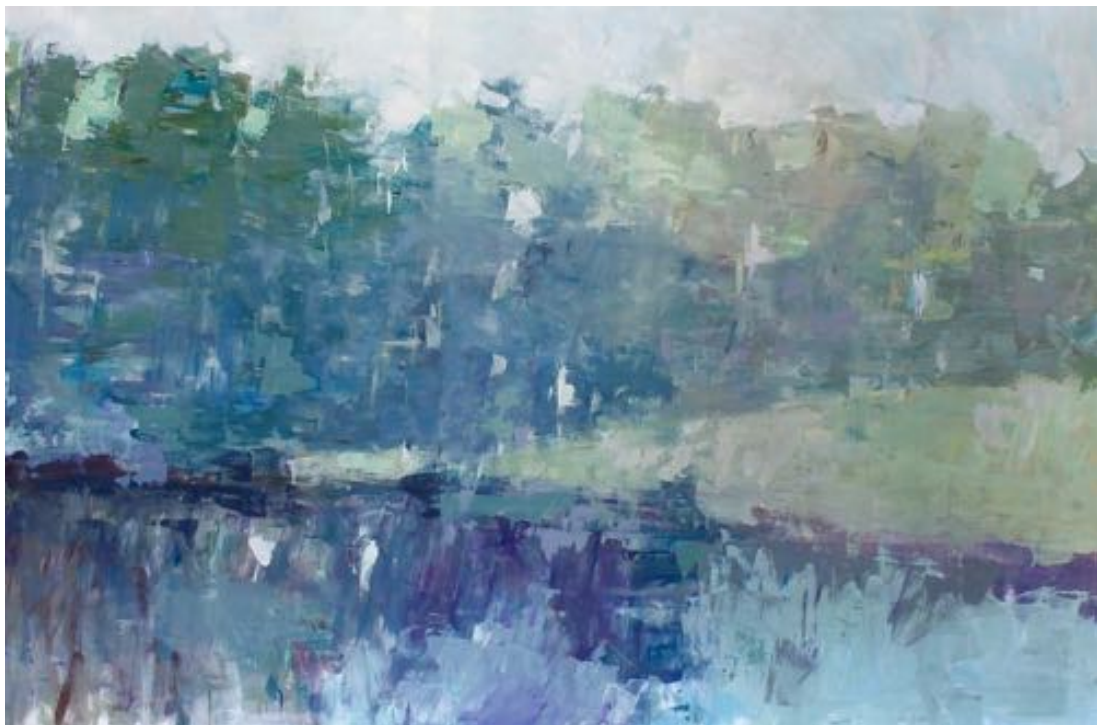
Hanging at Winifred's, 2019 Mixed Media on Paper, 42x64