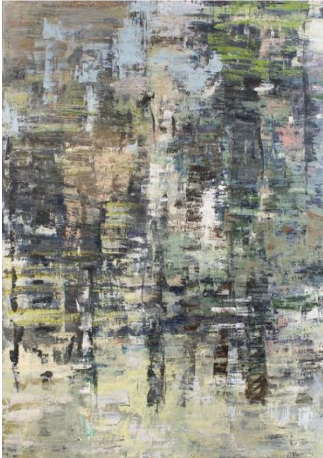
Edge of the Woods 1, 2019 Mixed Media on Canvas, 72x54