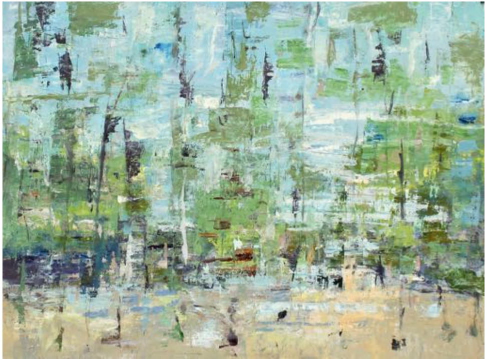
Nature Study 6, 2019 Oil on Paper, 22x30