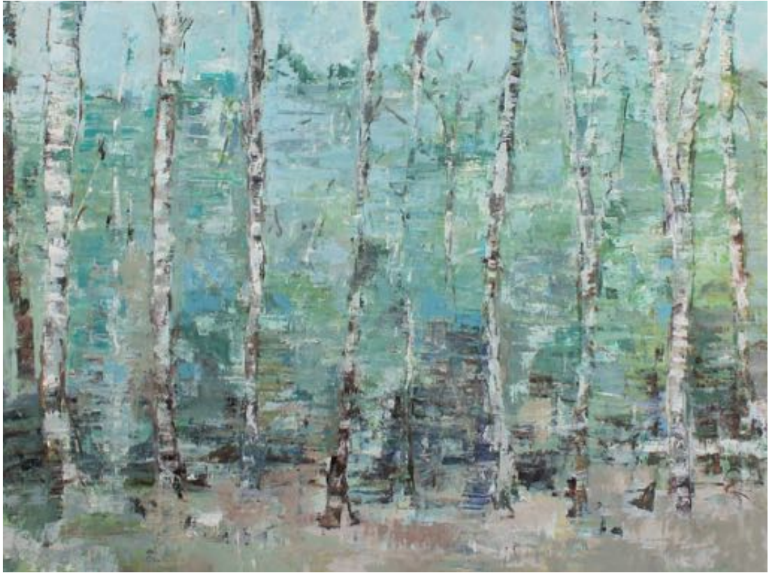
White Trees 6, 2019 Mixed Media on Canvas, 64x86