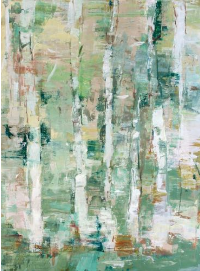
White Trees 1, 2019 Mixed Media on Canvas, 40x30