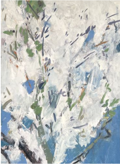
Bailey 8, 2021 Oil on Unstretched Canvas 39.50 x 30 in $3,900.00