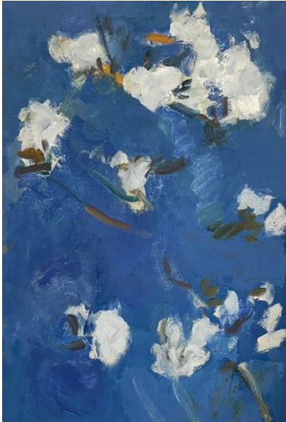
Stem and Branches, 2022