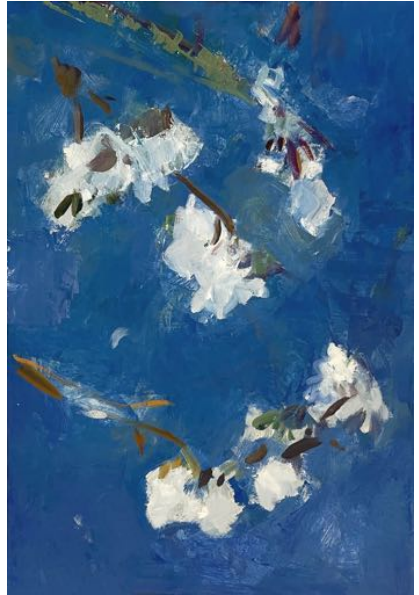
Stem and Branches, 2022