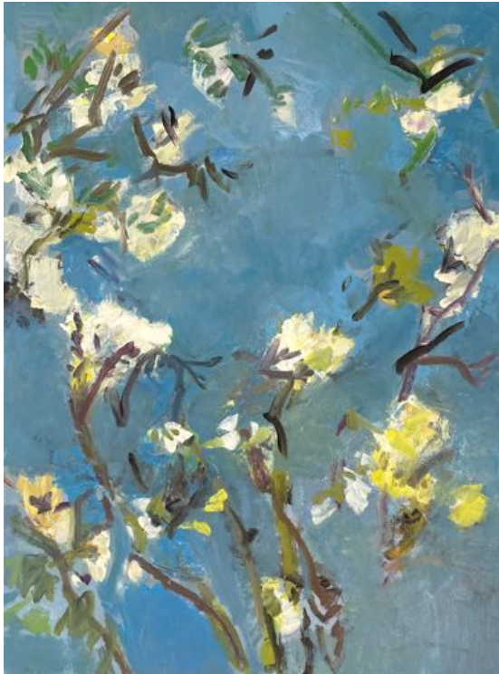
Stem & Branch 20, 2021 Oil on Unstretched Canvas 39.50 x 30 in $3,900.00