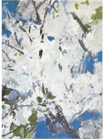
Bailey 7, 2021 Oil on Unstretched Canvas 39.50 x 30 in $3,900.00