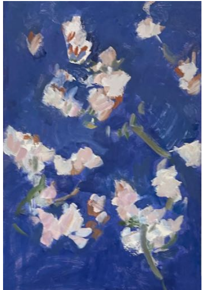
Stem and Branches, 2022