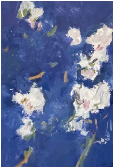
Stem and Branches, 2022