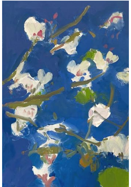
Stem and Branches, 2022 Oil on Paper 22 x 15 in $1,100.00