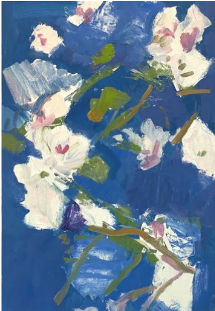
Stem and Branches, 2022 Oil on Paper 22 x 15 in $1,100.00